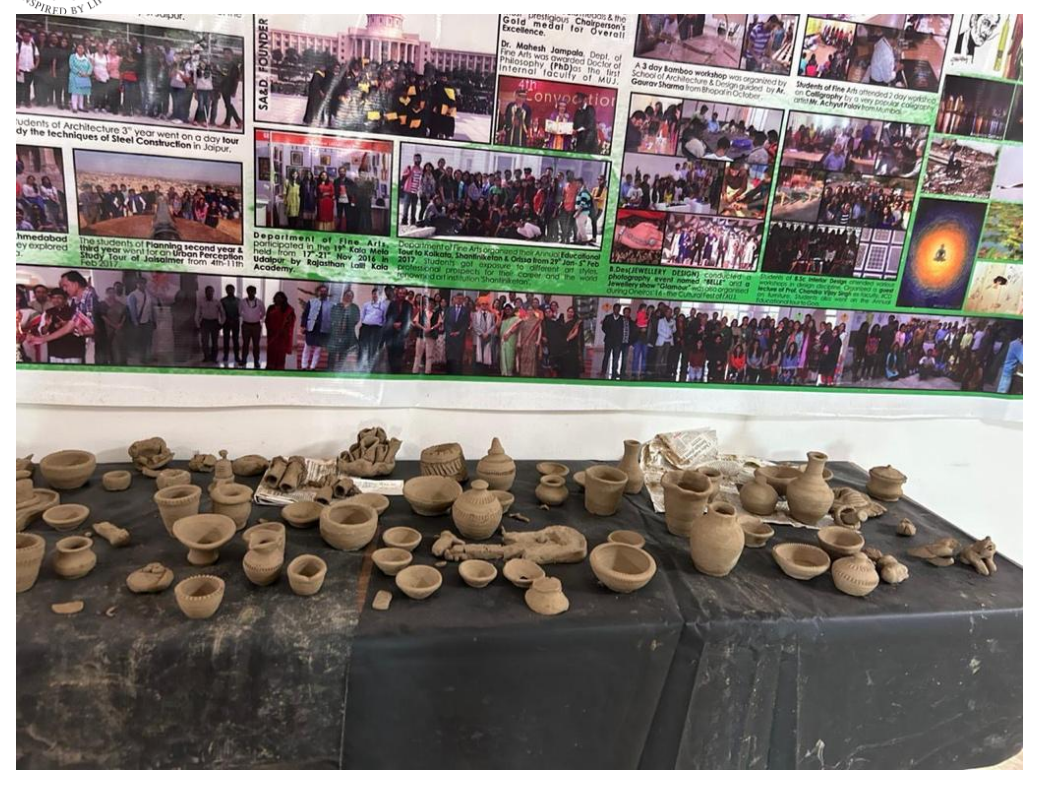
Picture 10: Clay art made by the students of MUJ Promoting Local Art